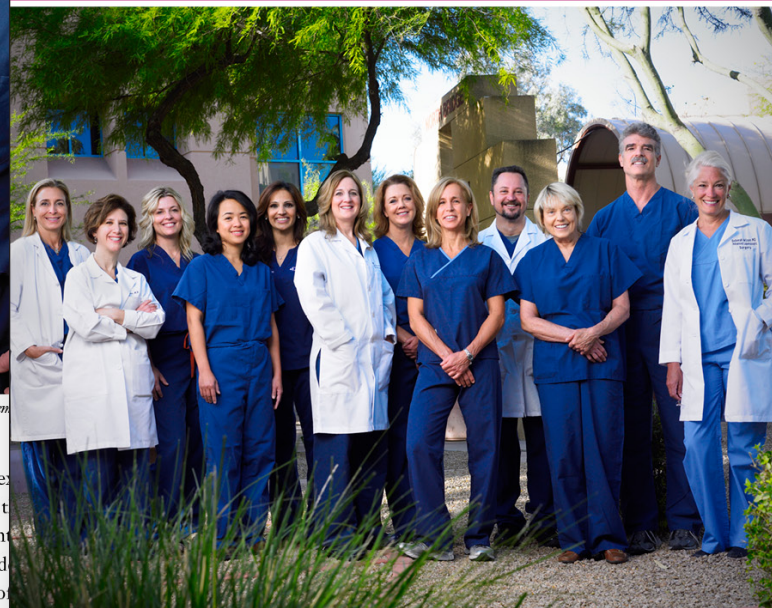
Scottsdale Healthcare was the first hospital in Arizona to acquire the da Vinci robotic surgical system.