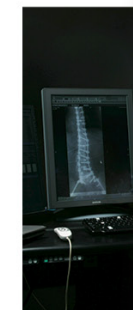
Orthopedic spine surgeon performing minimally invasive spinal surgery

We treat common traumatic spine injuries with minimally invasive techniques. The benefits of minimally invasive surgery include less scarring of muscles and soft tissues. Scottsdale Healthcare offers minimally invasive surgical imaging of a patient's spine during surgery. Instruments are placed through the patient's anatomy and then onto the spine for the entire operation. Because it allows the surgeon to see the spine without damaging delicate structures, minimally invasive spinal procedures are ideal for spinal fractures.